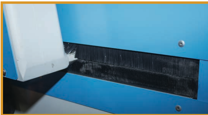
SEALS WITH POSITIVE PRESSURE BLOWER