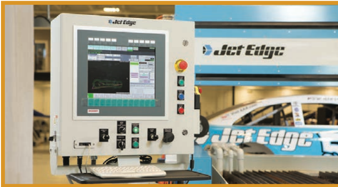
AQUAVISION DI MOTION CONTROLLER