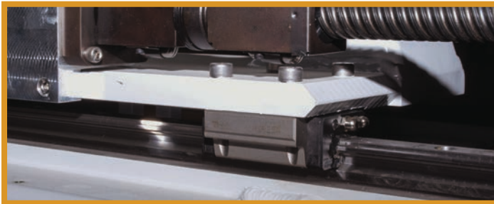
“HEAVY DUTY” LINEAR BEARING